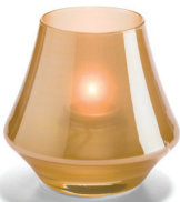
6955SG Satin Gold