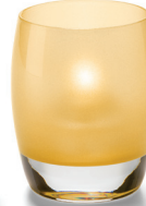
6404SG Satin Gold