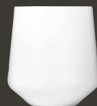
Stemless Wine, 12oz 0606611147W H 4" M 3 3/8" T 3" B 1 3/4" 24/cs $168.00/cs