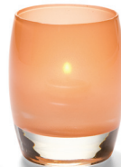
6404STC Satin Terra Cotta