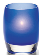
6404SDB Satin Dark Blue