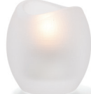
6701SC Satin Crystal