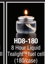
HD8-180 8 Hour Liquid Tealight™ fuel cell (180/case)

SEE REVERSE FOR ADDITIONAL LAMPS www.hollowick.com