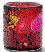
6301RG Red & Gold