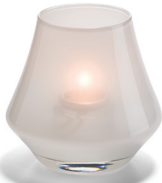
6955SL Satin Linen