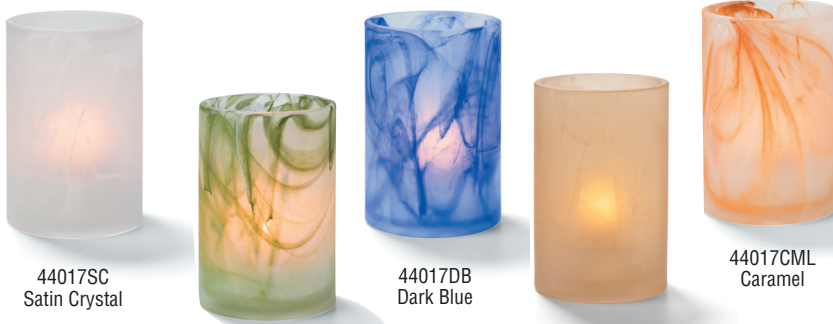
44017SC Satin Crystal

in: 4½H x 2¼Dia. mm: 118H x 73Dia. (Wt. 0.9#) Use HD17 or HD12-144 fuel cell