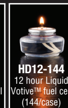
HD12-144 12 hour Liquid Votive™ fuel cell (144/case)