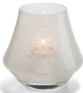
6955CJ Clear Jewel

in: 3½H x 2½Dia. mm: 89H x 70Dia. (Wt. .6#) Use HD15 or HD8-180 fuel cell