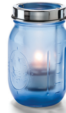
1610SDBL Satin Dark Blue with Cradle™