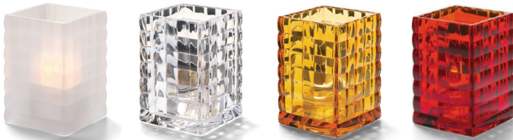
1533SC Satin Crystal

in: 3¾H x 2½Sq. mm: 95H x 67Sq (Wt. 0.9#) Use HD17 or HD12-144 fuel cell