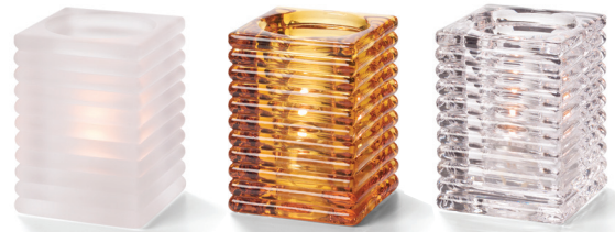
1511SC Satin Crystal

in: 4¾H x 2½Sq. mm: 105H x 73Sq. (Wt. 1.8#) Use HD17 or HD12-144 fuel cell