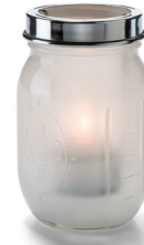
1610SL Satin Linen with Cradle™