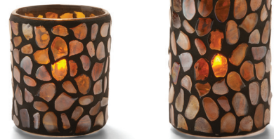
6256A Amber Votive

in 4¾H x 3¼Sq. mm: 111H x 79Sq. (Wt. .5#) Use HD17 or HD12 fuel cell