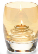
6404G Gold Lustre