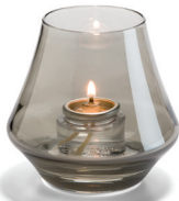
6955S Smoke Lustre