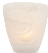
6817SC Satin Crystal