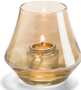
6955G Gold Lustre