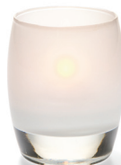
6404SL Satin Linen

in: 3½H x 3Dia. mm: 95H x 76Dia. (Wt. 0.8#) Use HD15, HD12-144 or HD8-180 fuel cell