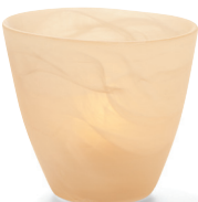
6817SCA Amber Satin Crystal