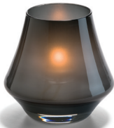
6955SM Satin Midnight