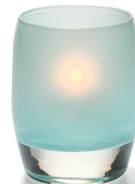
6404SSG Satin Seafoam