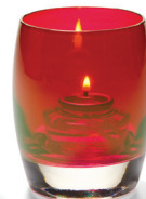
6404R Ruby Lustre