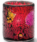
6301RG Red & Gold

in: 3¼H x 3Dia. mm: 83H x 76Dia. (Wt. 0.9#) Use HD15, HD12-144 or HD8-180 fuel cell