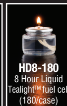
HD8-180 8 Hour Liquid Tealight™ fuel cell (180/case)

SEE REVERSE FOR ADDITIONAL LAMPS www.hollowick.com