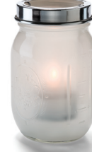
1610SL Satin Linen with Cradle™