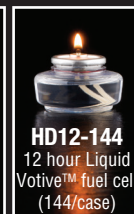
HD12-144 12 hour Liquid Votive™ fuel cell (144/case)