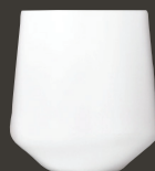
Stemless Wine, 12oz 0606611147W H 4" M 3 3/8" T 3" B 1 3/4" 24/cs $168.00/cs