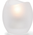
6701SC Satin Crystal